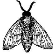
Figure 3: A sample black and white graphic that has been resized with the includegraphics command.

Immediately following this sentence is the point at which Table 2 is included in the input file; again, it is instructive to compare the placement of the table here with the table in the printed output of this document.