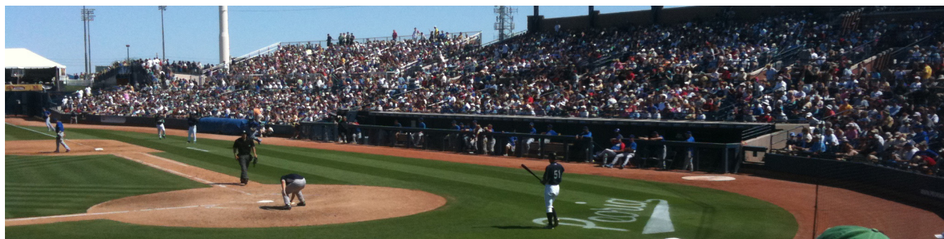
Figure 1: This is a teaser

Julius P. Kumquat The Kumquat Consortium jpkumquat@consortium.net